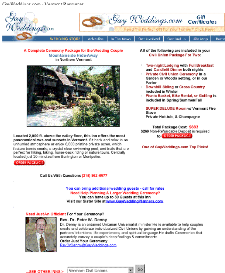
Figure 2: gayweddings.com