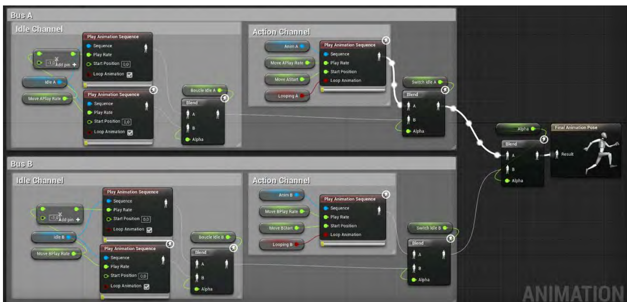
Figure 3. Unreal Engine 4 animation Finite State Machine of a specific type of OAV

Firstly, OAV can be controlled in real time by a mocaptor, acting in front of the screen, or aside the stage, hidden or not. The OAV figures out a living shadow that acts on the 3D stage in respect of a scenario in